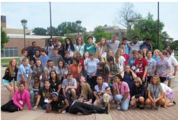
Left: NCYC Youth Animators complete a challenge during a team-building and communications skills workshop at Marian University in July 2015. Right: Over 50 high school students from across the country participated in this year's NCYC Youth Animators program. Marian University San Damiano Scholars helped lead campus tours and interacted with the students during their stay on campus.

In the Decree on Ecumenism (Unitatis Redintegratio) , issued at the Second Vatican Council, the Bishops of the Catholic Church stated, "Today, in many parts of the world, under the influence of the grace of the Holy Spirit, many efforts are being made in prayer, word and action to attain that fullness of unity which Jesus Christ desires. The sacred Council exhorts, therefore, all the Catholic faithful to recognize the signs of the times and to take an active and intelligent part in the work of ecumenism." Marian University, in the tradition of Saints Francis and Clare and the Sisters of St. Francis, Oldenburg, Indiana, has long embraced this ecumenical spirit as they have served the needs of diverse populations in central Indiana, throughout the United States, and, the world.