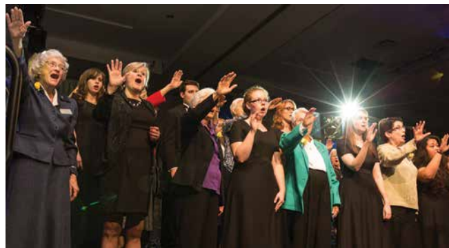
Top: Over 1,600 Marian University friends and supporters attended the Rising to the Challenge, Creating Leaders Gala in 2014. Bottom: One highlight of the night was a moving performance of the benediction by the Sisters of St. Francis, Oldenburg, Indiana and the Marian University Sacred Choir.