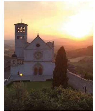
Basilica Papale di San Francesco in Assisi, Italy.