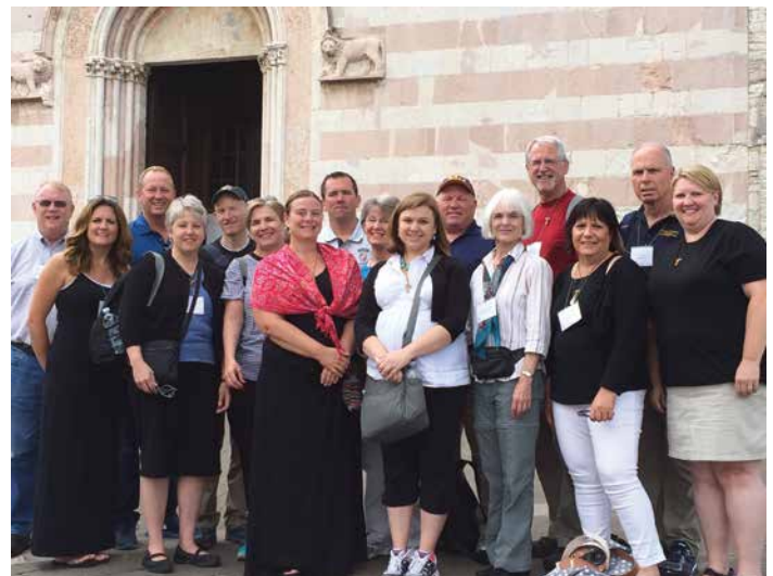
Marian University pilgrims gather outside the Basilica di Santa Chiara in Assisi, Italy where Saint Clare is entombed and the original San Damiano cross is housed.