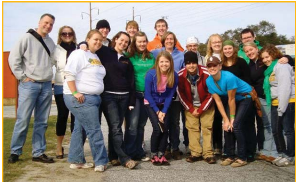
Marian University students participate in the School of the Americas Vigil in Columbus, Georgia, honoring victims of violence in Latin America.

Students enrolled in Peace and Justice Studies are eligible to participate in one of two residential learning communities—the Dorothy Day House for Peace and Justice and the Peter Maurin House for Peace and Justice. The Peace and Justice Studies houses are vibrant hubs of student culture and civic discussion. The communities are modeled after principles embraced by the Catholic Worker Movement including non-violence, simple living, and community engagement. The students living in the Peace