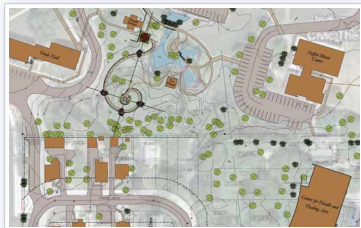
Site plan showing the location of the Blessed Mother Mary Shrine and Rosary Walk between the new medical school building, Steffen Music Center, and Doyle Hall.

The Catholic Church calls its educational institutions to be a Christian witness. On a college campus, that means providing spiritual guidance to students as they explore new paths, integrating Catholic perspectives across the curriculum, promoting deeper knowledge in specific subjects—like nursing and teaching—where our holistic education shines in the light of faith, and creating sacred spaces where everyone who visits campus can be with God.