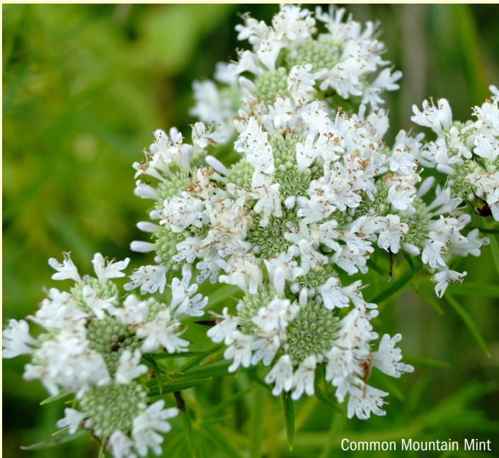
Common Mountain Mint

Visit Marian.edu/ecolab to Pre-Order and for MUCH MORE INFORMATION