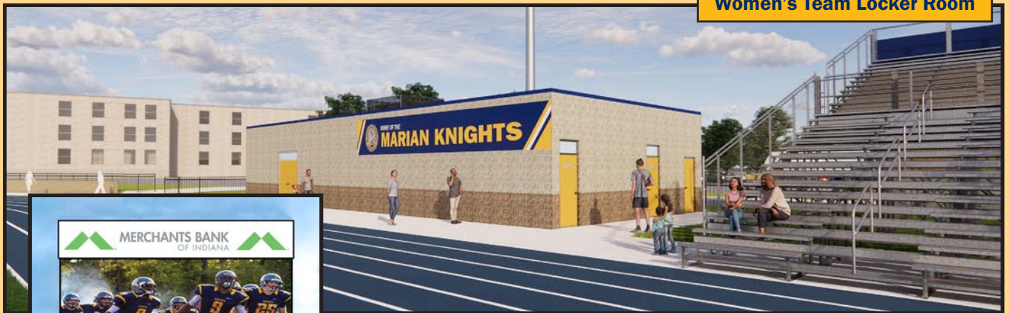
Women's Team Locker Room

WHAT WILL YOU DO TO HELP STUDENTS REALIZE THEIR DREAMS!